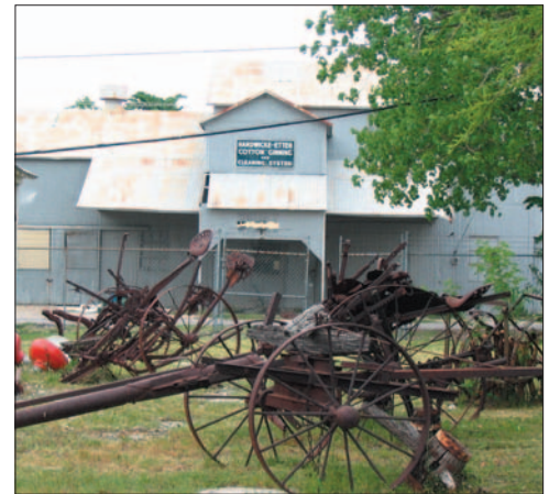
Downtown Rowlett Cotton Gin Near Proposed Downtown Station

A Community Work Group will be established to provide targeted citizen input to the environmental impact analysis. It will be comprised of representatives of homeowner associations, property owners, business leaders, and others; working together to stay informed about the project and to inform the Project Team about issues that affect them.