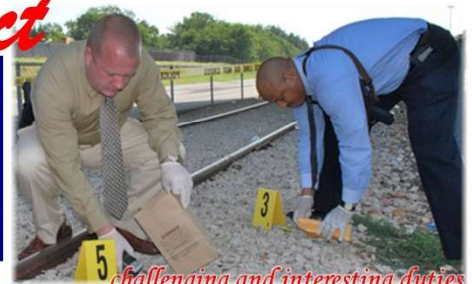
challenging and interesting duties