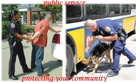
protecting your community

Apply online at: www.DART.org/webapps/hrportal