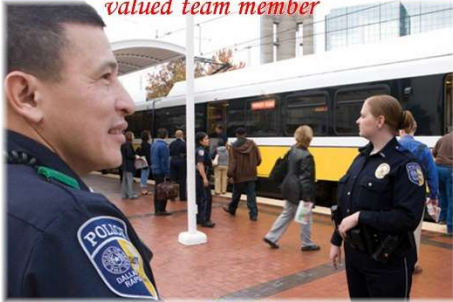
valued team member