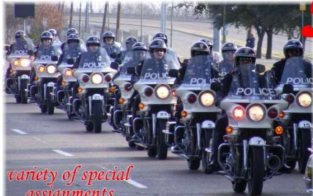
variety of special assignments