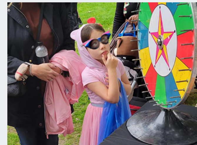
Trunk-or-treater spinning the DART wheel of treats.

DART and AWH (Archer Western Herzog) traveled to Coppell, Addison, Carrollton, Plano and Richardson bringing along ice cream and the DART Lego train. They were there for community members to have easy access to the construction team and be able to ask all of their construction related questions while enjoying a sweet treat. Thank you to everyone that came out to eat ice cream with the team and made the events such a success!