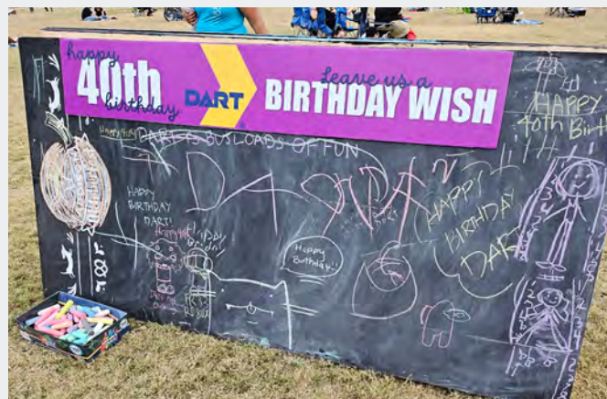
DART encouraged festival attendees at Addison's Harvest HeyDay Festival in October to write birthday messages near its booth celebrating the transit agency's 40th anniversary.

School is back in session! This means that students will be around and near DART rail lines and active construction sites more regularly. To make sure that parents and students received rail safety information, the Silver Line team attended Meet the Teacher Night at several local schools. The team had a table that parents and students were able to visit and get Silver Line information and a goody bag. The bags included rail safety material, Silver Line swag, DART coloring books, and information on DART's other programs. If you would like the Silver Line team to come out to your school, email SilverLine@DART.org for more information.