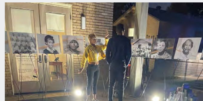
Residents view artwork that highlights the historic Douglass Community that will be featured at the future 12th Street Station.

DART visited the Highland Springs Senior Living Community in September to provide an update on the status of the construction of the Silver Line and the Cotton Belt Regional Trail with pastries in hand. With construction ramping up, the team was able to answer questions and concerns regarding construction on roads and near their property. The Highland Springs residents will have two access points to the Cotton Belt Trail from their property and are eager to be able to use it for daily exercise and there were approximately 250 residents in attendance.