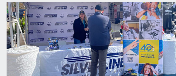
City of Carrollton residents and visitors enjoying the Switchyard Festival 2023

The DART Silver Line team was at Campbell Green Recreation Center's (North Dallas) and (Carrollton) Creekview High School's Trunk-or-Treat events. Participants spun the wheel to win Silver Line and DART swag. Parents and families learned more about upcoming closures and the ongoing project construction.