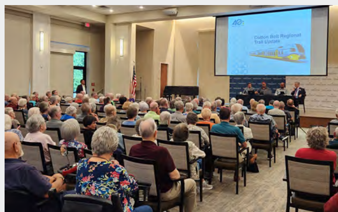
More than 200 residents of the Highland Springs Senior Living Community attend update on Silver Line.

In celebration of 40 years, DART is holding block parties in each service city. Find a free block party near you and learn more at https://www.dart.org/40th .