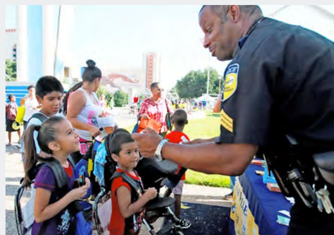
DART Police interacting with local students.

The Addison Oktoberfest was a huge success. Silver Line team members hosted a booth at the event and about 100 people stopped by to get information on the Silver Line and receive fun goodies. Most of the visitors were familiar with DART and were excited about the commuter rail project coming to Addison.