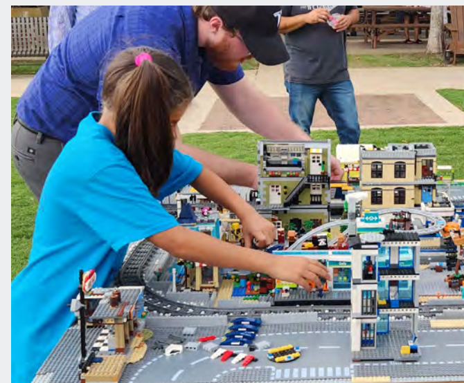
Carrollton residents check out the DART Silver Line Lego Train Display at an ice cream social in downtown Carrollton.

DART Silver Line co-sponsored "Jazz Under the Starz" with the Douglass Visions Committee in Plano. This event celebrated art, culture, and community with a live jazz performance by The Michael Walker Project. DART shared a display of the windscreens that will be located at the 12th Street Aerial Station. This station will be at the entrance to the Douglass Community and provide a new connection to public transit for the neighborhood.